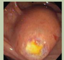
In this picture, a large bile duct stone is impacted at the major duodenal papilla causing obstruction and severe infection of the bile duct. In this case, ERCP is urgently required to relieve the obstruction.